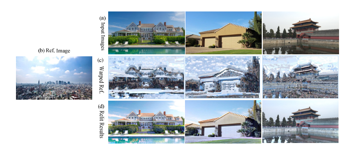
Fig. 3. The relit results of our method