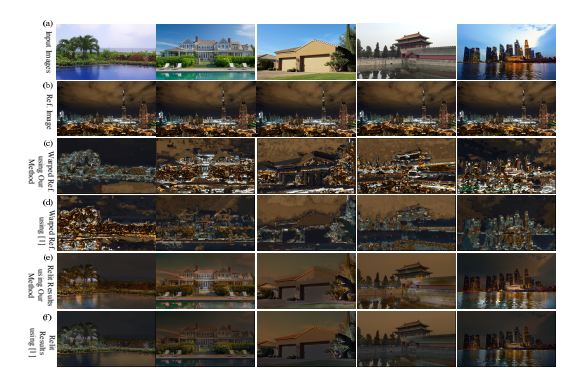
Fig. 4. Comparison with [1]

We compare our method with the state of the art method [1], which needs a timelapse video captured by a fixed camera working for 24 hours. While our method needs only a single reference image. We randomly select 5 input images for comparison. As shown in Fig. 4, (a): multiple input images, (b) the reference image, (c): warped reference images to corresponding input images, (d): warped reference images using method of [1], note that they need a time-lapse video for warping, (e): the relit results using our proposed method, (f): the relit results using the method of [1]. The results reveal that our method can produce similar relit results as those of [1], with only a single reference image.